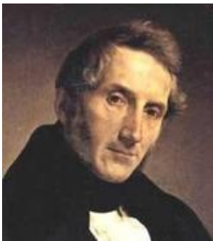
Alessandro Manzoni, the writer to whom Verdi Requiem dedicated.

Dies irae Day of wrath, that day will dissolve the world in flames as predicted David and the Sibyl.